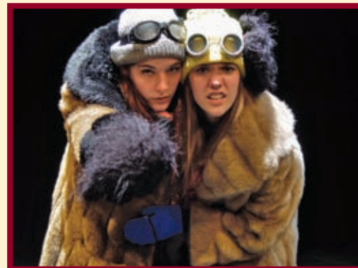
A scene from Antarctica.