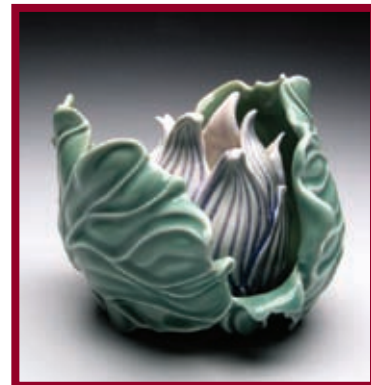
"Movement of Nature 24," a ceramic work by Kyounghwa Oh, was a 2007 NICHE Award winner.

The institute's research and service activities include investigating treatment approaches for autism, methamphetamine addiction, traumatic brain injuries, and gambling disorders. In spring 2007, 211 students were enrolled in the Rehabilitation Institute's five graduate degree programs.